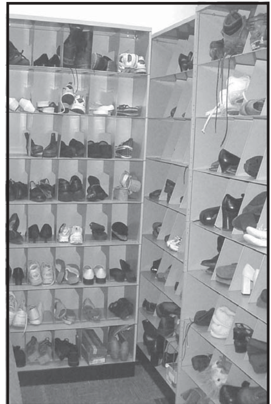
Donated shoes are organized on shelves at Lutheran Family Services in Omaha.