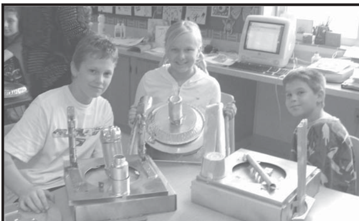
Students from the 5th grade art class at Rousseau Elementary School in Lincoln used discarded materials to create their "Junk Sculpture" art.

Thanks to all the program participants who provided items for this unique and fun project!