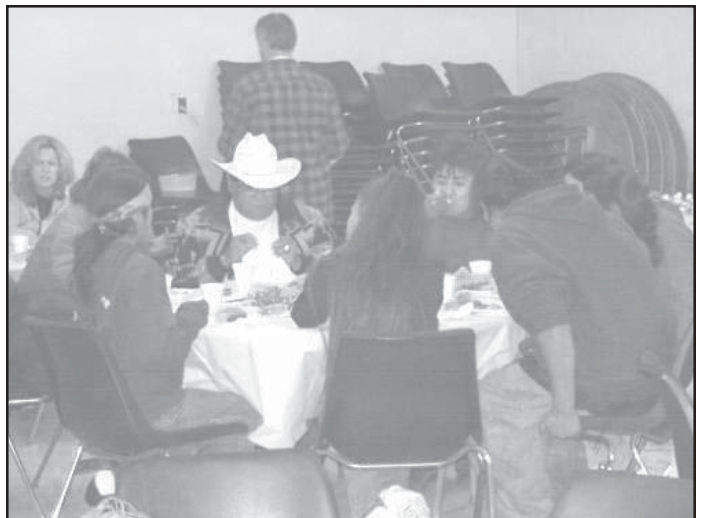
Area residents near Whiteclay enjoy a hearty Thanksgiving meal at the local dining hall. The chairs for the dining hall were originally used in the cafeteria and music room at Nebraska Wesleyan University in Lincoln.

Thanks to Nebraska Wesleyan for choosing to pursue a reuse option for their unwanted items. Thanks also to The ABOUT Group who, quite literally, went the extra mile to make sure they had the materials necessary to open the Whiteclay facility.