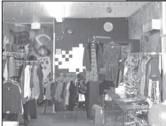
The thrift store in Whiteclay, Nebraska is owned and operated by an outreach ministry, The ABOUT Group. Donated items like clothing, housewares, shoes, furniture, and small appliances are reused by area residents.