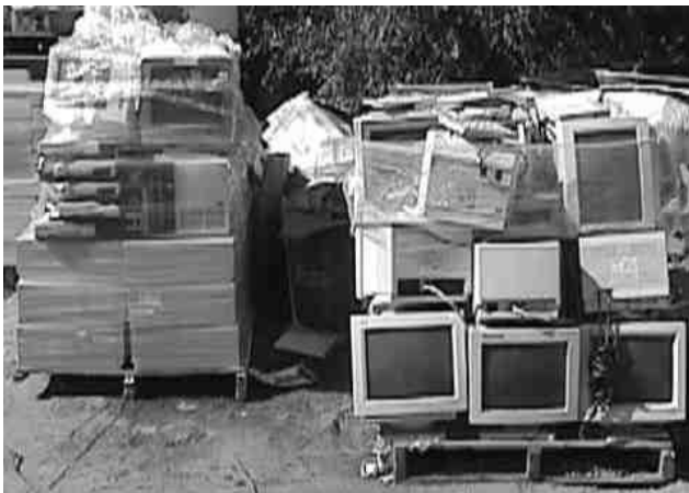
Two of the 120 pallets of computers and peripherals picked up by Junkman's Recycling

Omaha company contacts Materials Exchange Program regarding disposal options for numerous pallets of computers, keyboards, printers, and other computer components. Junkman's Recycling in Kearney was contacted, a semi was dispatched to begin the process of picking up more than 100,000# of computers and peripherals. All items will be recycled or reused.