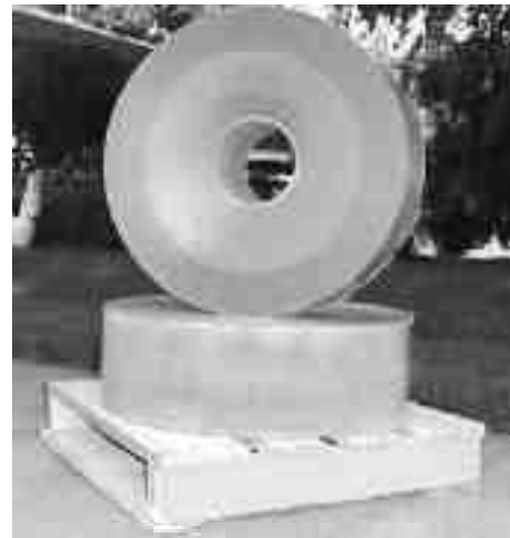
Examples of the adhesive films

Background: Company has large quantities of adhesive films in several sizes, textures and colors. This is ideal for art projects, book covers, outdoor signage, bumper stickers and many other uses.