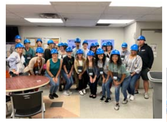
Conference participants tour FirStar Fiber