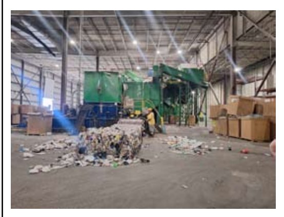
Processing materials at FirStar Fiber